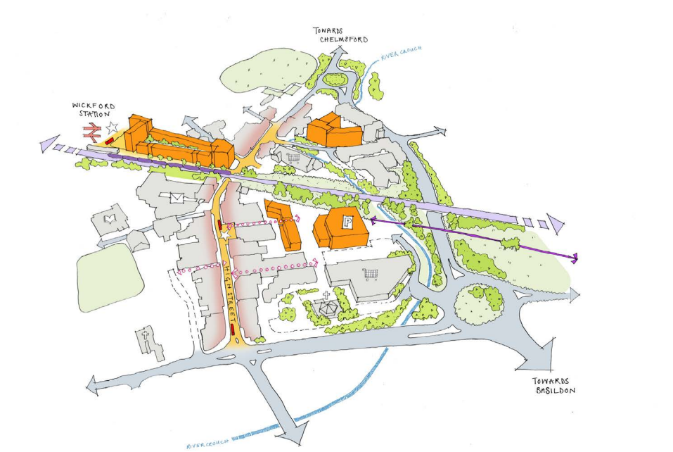
Wickford Town Centre Basildon