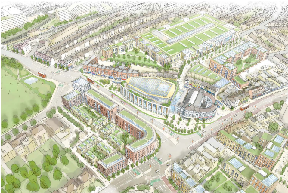
Catford Town Centre Lewisham