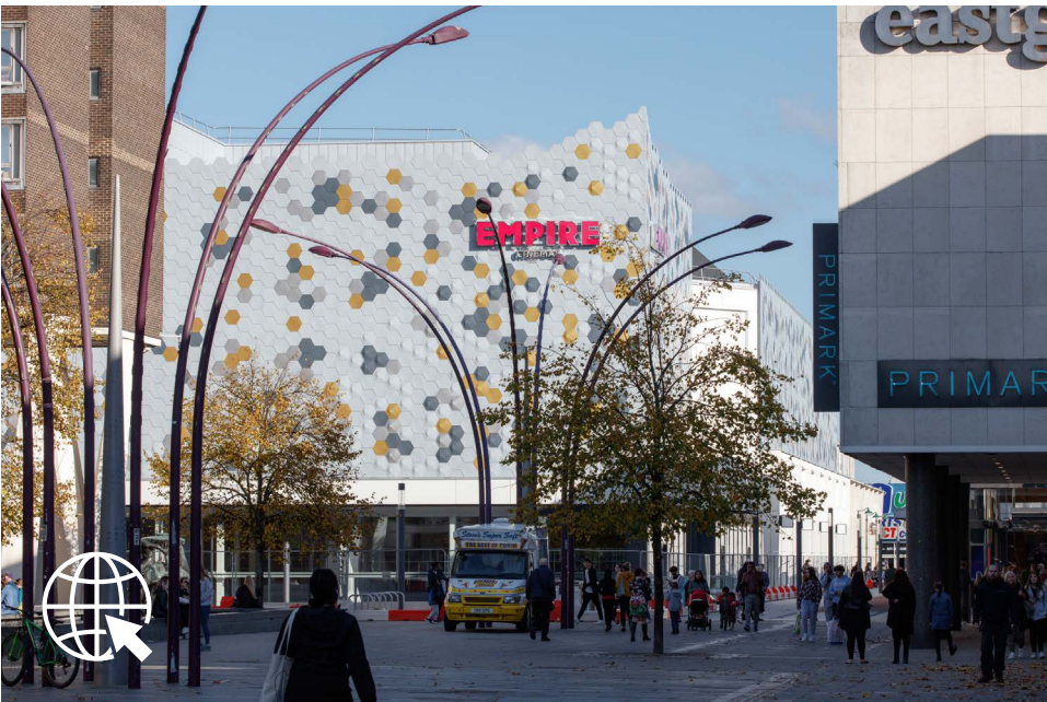
East Square Cinema Basildon