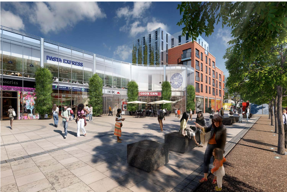
Wards Corner Haringey