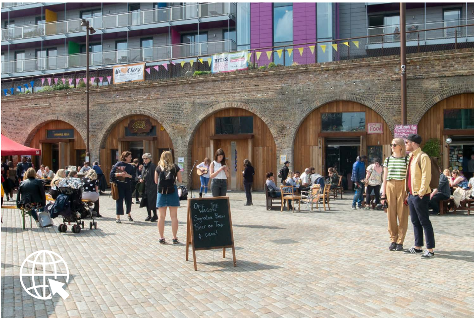
Deptford Market Yard Lewisham