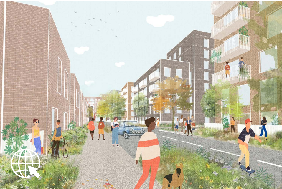
Hayes Town Centre Hillingdon